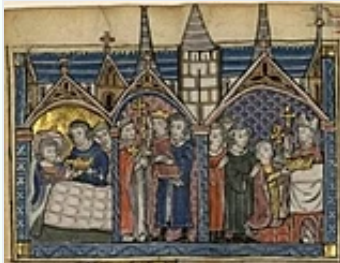
Raymond's appointment as regent by Baldwin IV of Jerusalem

Raymond III (1140–1187) was the count of Tripoli (in modern-day Lebanon) from 1152 until his death. The son of Raymond II and Hodierna of Jerusalem , he was a minor when he succeeded his father. After reaching the age of majority in 1155, he fought the powerful Muslim ruler Nur ad-Din , and hired pirates to pillage Byzantine territories. From 1164, he spent nearly ten years in Muslim captivity. Marrying the wealthy heiress Eschiva of Bures made him prince of Galilee in the Kingdom of Jerusalem . A close relative of the royal family, he ruled Jerusalem as regent for Baldwin IV between 1174 and 1176, and for the child Baldwin V from 1185 to 1186. After the child king's death, he could not prevent the coronation of Baldwin V's mother Sibylla and her husband Guy of Lusignan . He paid homage to Guy only after Jerusalem was invaded by Saladin , the Muslim ruler of Egypt and Syria. One of the few crusader leaders who escaped from the battlefield at Hattin , he died soon after, probably of pleurisy . ( Full article... )