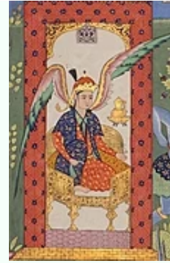
Queen of the fairies in the Khalili Falnama

Archive · Start a new article · Nominate an article