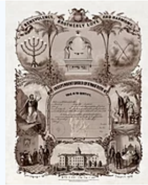
B'nai B'rith membership certificate, 1876