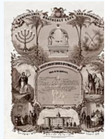
B'nai B'rith membership certificate, 1876