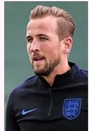
Harry Kane in 2018

European Championship tournaments. He scored his first international hat-trick at the 2018 FIFA World Cup against Panama , where he would win the tournament's Golden Boot. During the UEFA Euro 2020 main tournament, he scored 4 goals in the knockout stage as he captained the side to their first international final since 1966. During the 2022 FIFA World Cup , he equalled Wayne Rooney 's international record in the quarter-final against France , before surpassing it in 2023 in a UEFA Euro 2024 qualifying match against Italy . ( Full list... )