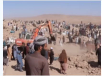
Herat earthquakes aftermath