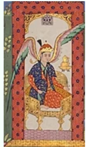
Queen of the fairies in the Khalili Falnama

Archive · Start a new article · Nominate an article